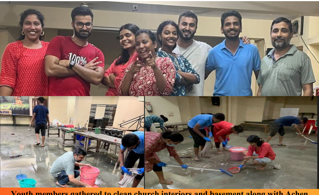
Youth members gathered to clean church interiors and basement along with Achen.